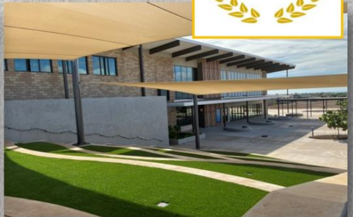
Above: Kūlanihāko‘i High School (Kihei High School, Phase 2)