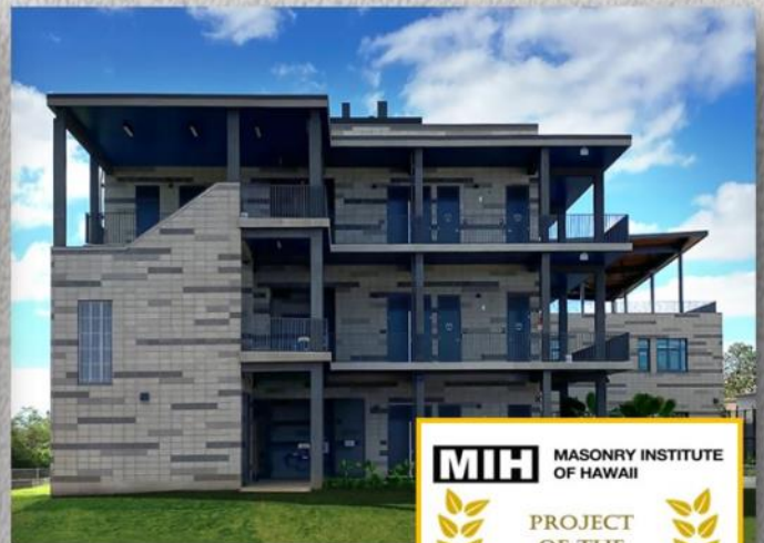
Above: Waipahu High School Integrated Academy