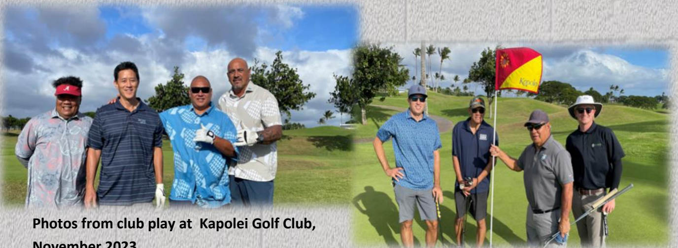
Photos from club play at Kapolei Golf Club, November 2023.