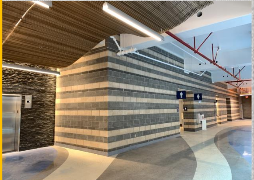
Honolulu Consolidated Rental Car Facility Architect: Demattei Wong Architect Engineer: Mitsunaga & Associates, Inc. Masonry Contractor: Affiliated Construction LLC