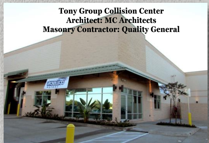
Tony Group Collision Center Architect: MC Architects Masonry Contractor: Quality General