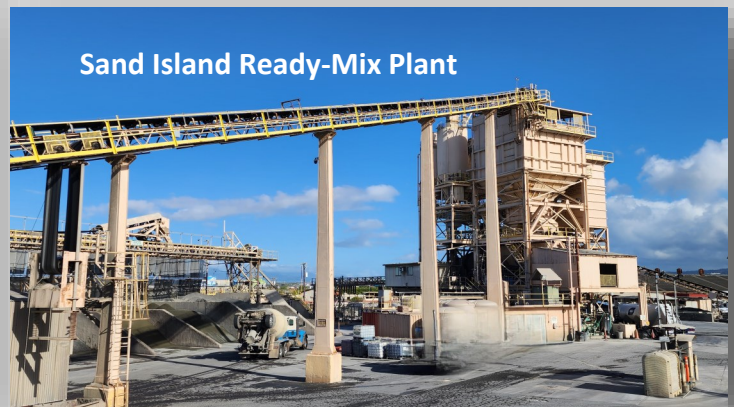
Sand Island Ready-Mix Plant