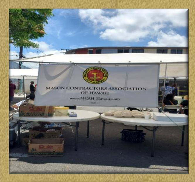
MIH & MCAH Hospitality Tent