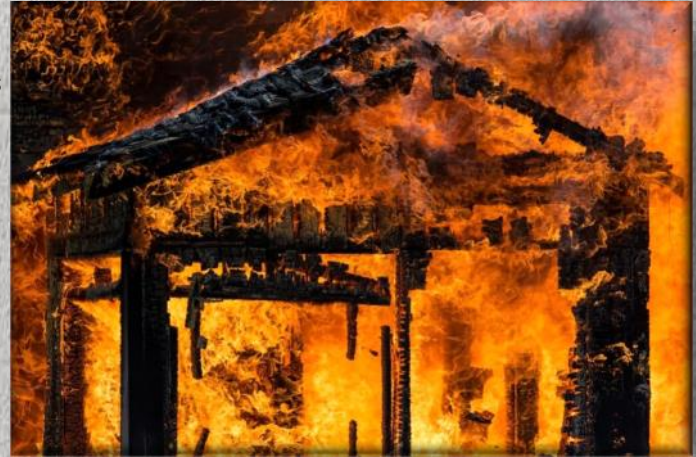
Wood and Steel Burning and Not Masonry

Structures made of brick, stone, clay or concrete goes back centuries. Any component of masonry is derived from naturally fire resistant material and in Hawaii, materials are sourced locally. The recognition of the advantages of non-combustible, and fire-resistive cement based construction is reinforced by the insurance industry through a