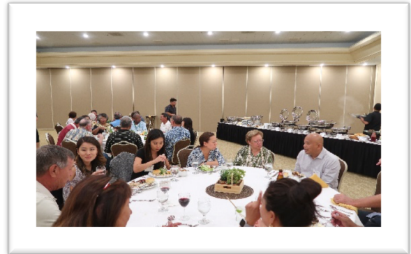
MCAH Members and Guests at Dinner, Turtle Bay Resort