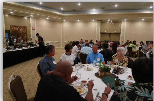
MCAH Dinner at Kuilima III, Turtle Bay Resort