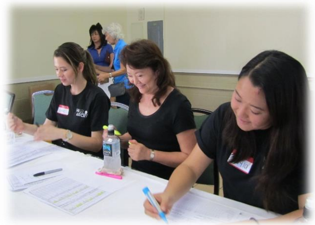
Hard at work at the registration desk